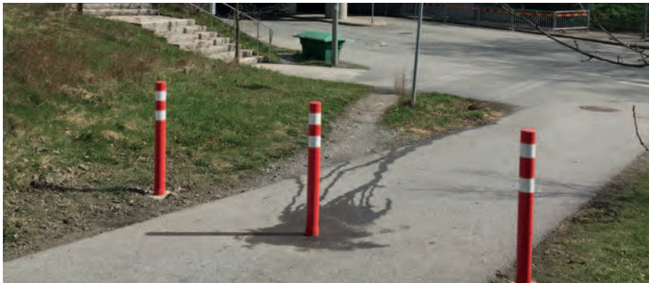
Above: The posts are used in a range of applications, such as lane delineation, pictured in Tampa, USA