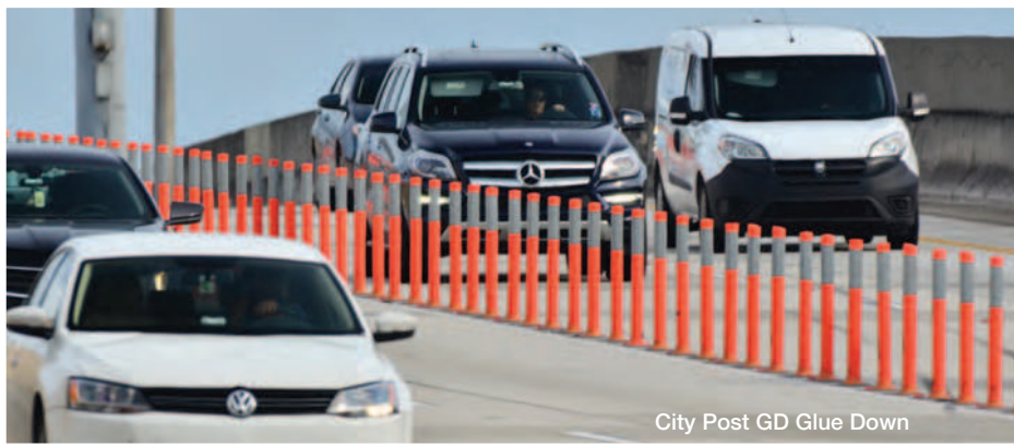
City Post GD Glue Down