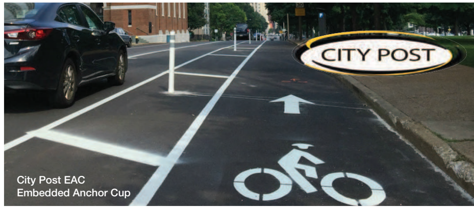
City Post EAC Embedded Anchor Cup