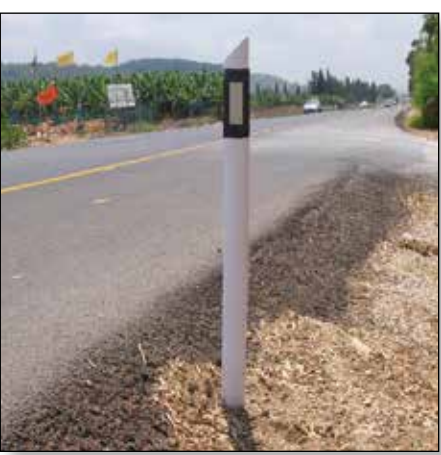
FG 500 Roadside Delineator Post