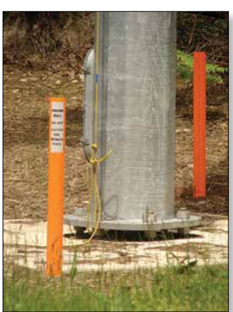
FG 500 Utility Marker