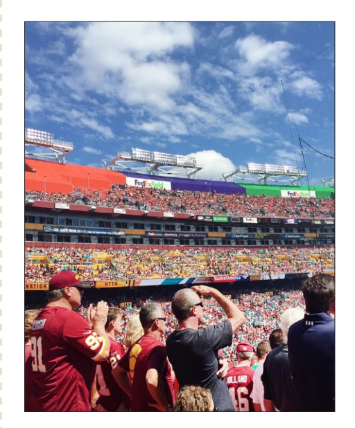
Millions of dollars are spent every year to market a corporate or institutional image.